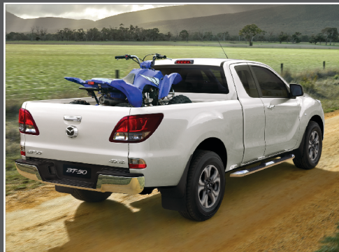
1 TON LOADING