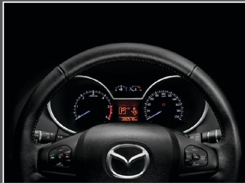
NEW CLUSTER DESIGN