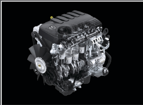
2.2L DIESEL ENGINE Intercooler Turbo Charger