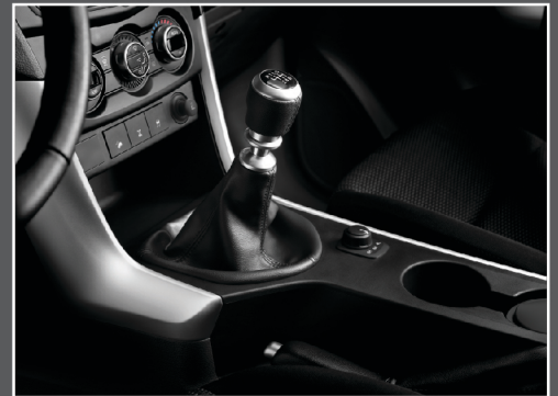
MANUAL 6 SPEED TRANSMISSION