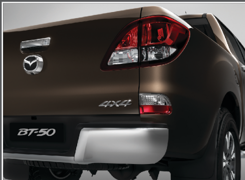
4 X 4 WHEEL DRIVE